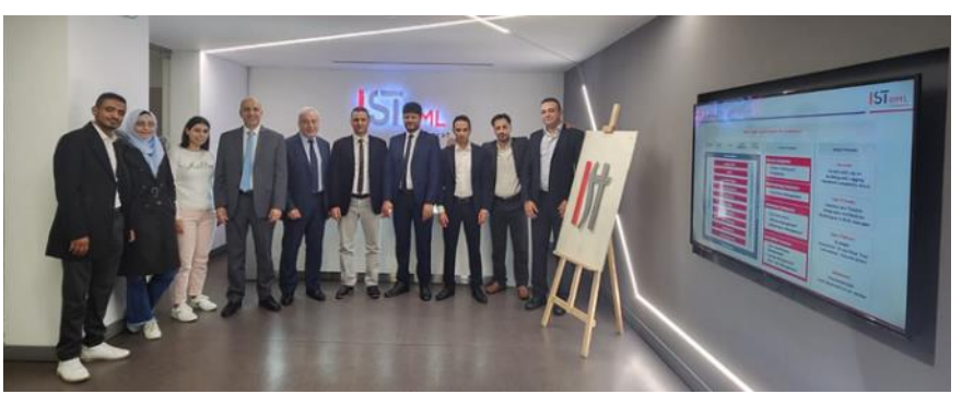
YGB Bank team – Bootcamp in Beirut