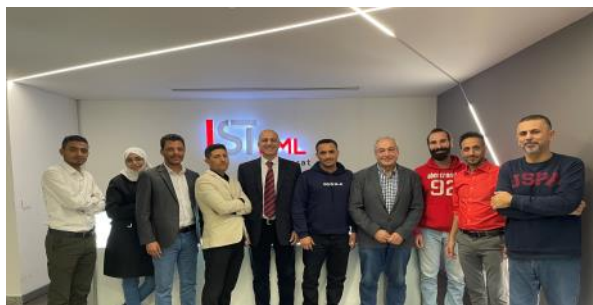
A delegation from YGB Bank visiting BML for a Training on ICBS G5